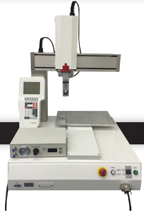
Desktop Dispensing Systems

Our valves and controllers are manufactured in the USA and are integrated with state of the art Janome desktop robots to provide industry leading quality. Every system is built and tested by Fancort Industries Inc. in New Jersey and supported by our team of in house engineers and technicians. When selecting a dispensing system it is highly important to select a system and most importantly a valve set that is compatible with the process.